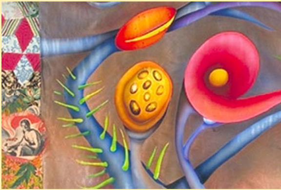
Detail, Simian Interface , © Kathy Weaver, 2003